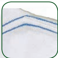
track stitching across shoulders