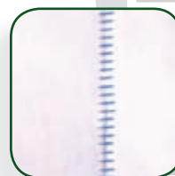
pick stitch on cuffs